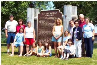
At Little House Wayside, Pepin, WI