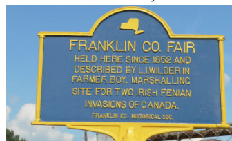
New Sign in Malone