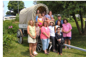
Outside Masters Hotel, Burr Oak, IA