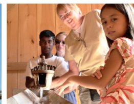
Pumping water-Wilder Farm

We relived Almanzo's life in Farmer Boy with a tour of the Wilder Farm home, the reconstructed barns, and their museum, which has added many new items. A tour of Malone and time at the county fair took us back to Almanzo's era.