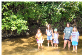
Wading in Plum Creek, Walnut Grove, MN