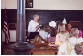
A lesson at Sunnyside School

On the Kansas-Missouri Tour we enjoyed a picnic in Mansfield, after visiting Rocky Ridge Farm-built by Laura and Almanzo. We toured Rock House, where the Little House Books were begun. Lamar, Missouri is the birthplace of Harry S. Truman. In this home we noted so many things mentioned by Laura in the Little House Books.